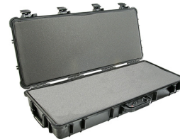
1700WF With Foam