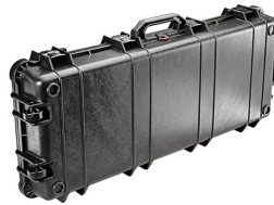
1700NF No Foam