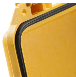
1703 Replacement O-ring