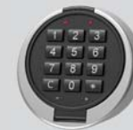
Electronic lock - Primor 3000 level 5