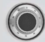
Mechanical code lock