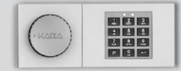
Electronic lock - B 90