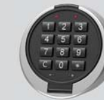
Electronic lock - Primor 3000 level 15