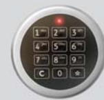
Electronic lock - Stellar Business