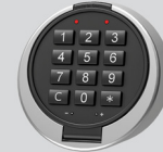
Electronic lock - Primor 3000 level 5