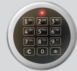
Electronic lock - Solar Business