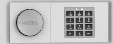
Electronic lock - B 30