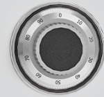
Mechanical code lock