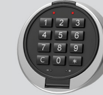
Electronic lock - Primor 3000 level 15