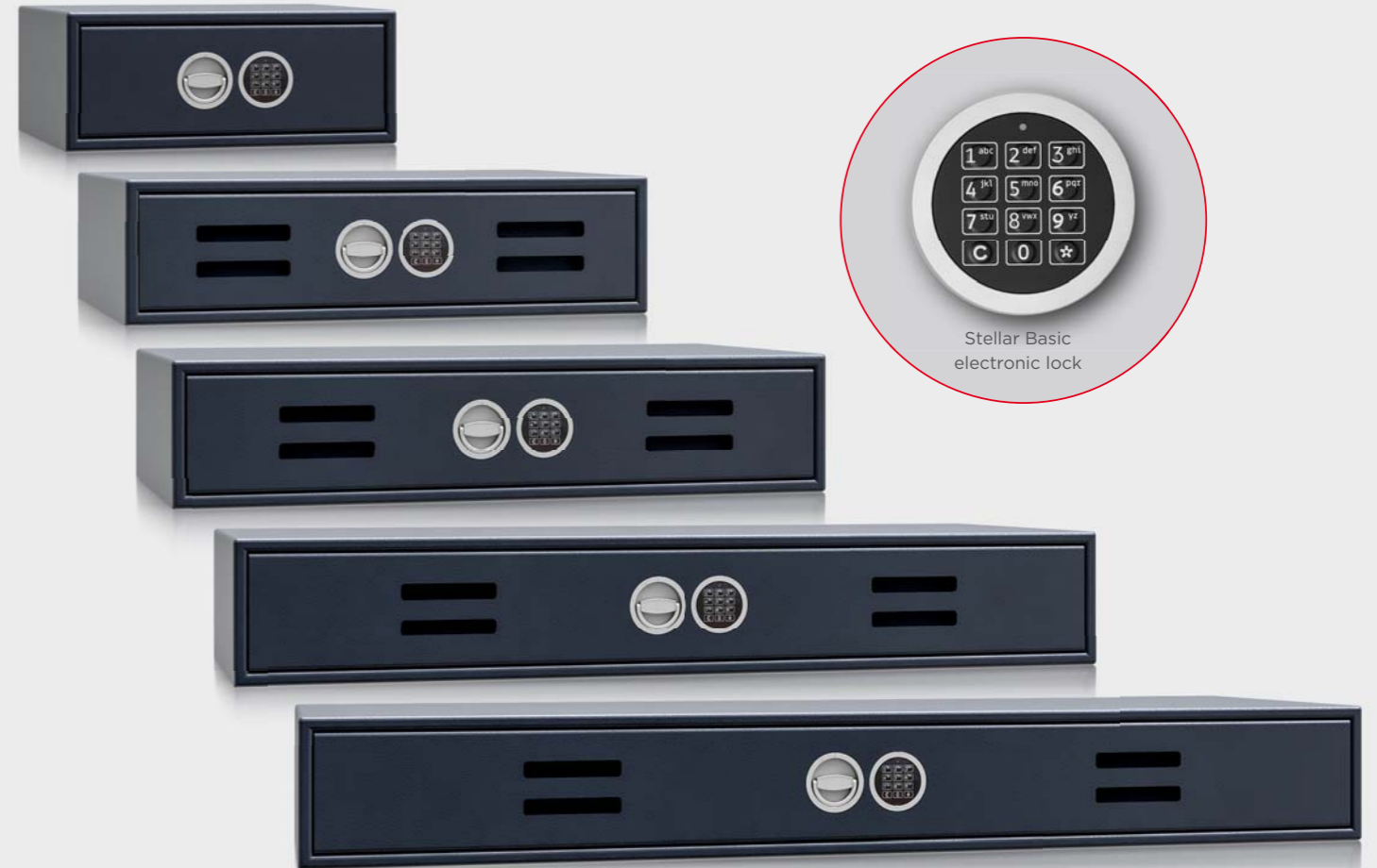
Stellar Basic electronic lock